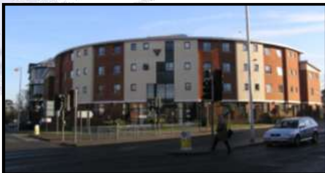
Y Centre, Albion Way, Horsham